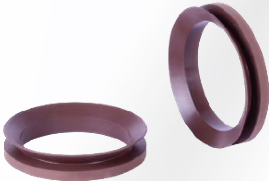
V SEALS V SEALS