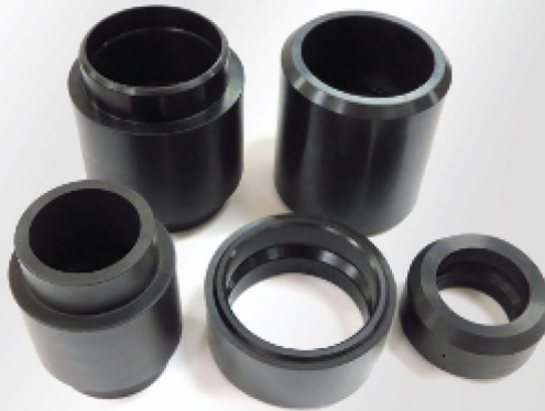
OIL WELL PACKERS

TRW offers a wide range of solutions, including