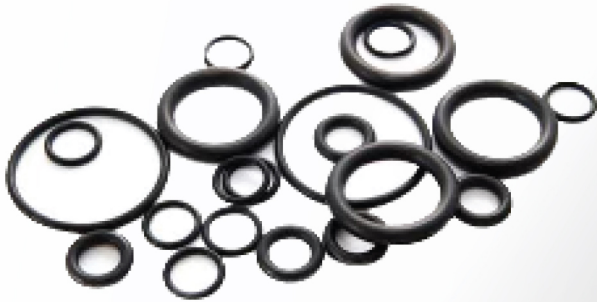
FKM O RINGS

For the past 40 years we have supplied rubber parts used in pumps industry. We offer product range like Rubber Gasket, Rubber Ring, Grommet, Sandgaurd, Rubber to metal bonded parts, Rubber Pressure Cup, Metal Inserted Neck Ring etc. We have supplied our rubber parts in submersible pumps as well as petroleum pumps. Material like NBR, EPDM, FKM etc. is widely used in this industry.