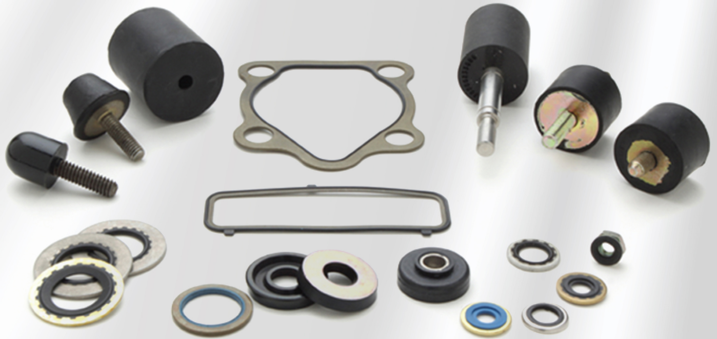
RUBBER TO METAL BONDED PARTS