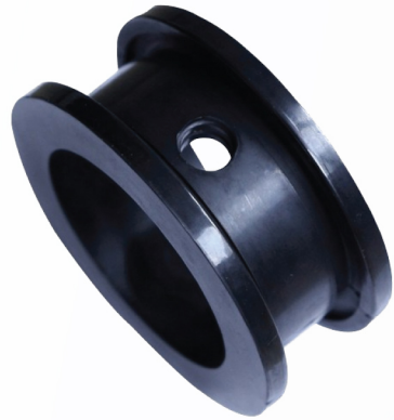
BUTTERFLY VALVE SLEEVES

For the past 40 years we have supplied rubber parts used in pumps industry. We offer product range like Rubber Gasket, Rubber Ring, Grommet, Sandgaurd, Rubber to metal bonded parts, Rubber Pressure Cup, Metal Inserted Neck Ring etc. We have supplied our rubber parts in submersible pumps as well as petroleum pumps. Material like NBR, EPDM, FKM etc. is widely used in this industry.