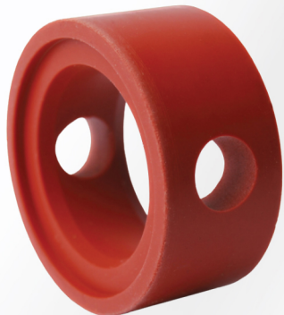
BUTTERFLY VALVE SLEEVES